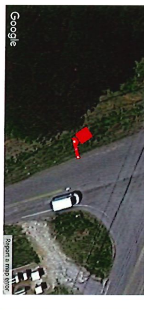
Distance: 10.4 ft.